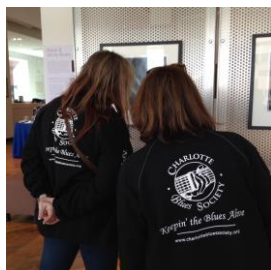
Charlotte Blues Society Members at Blues Hall of Fame

It is directly across the street from the Lorraine Motel and the National Civil Rights Museum. Highly recommend you check them both out!