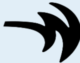
U.S. National Whitewater Center