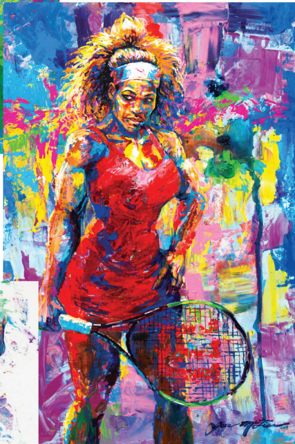
“Champion’s Stare” 2019, Acrylic on Metal, 24” x 36”