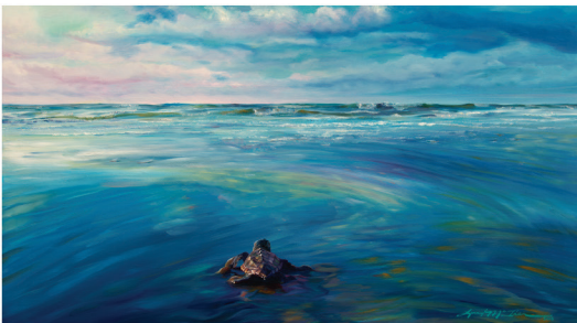
“Launch” 2016, Oil on Board, 36” x 21”