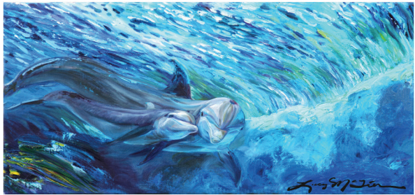
“All My Waves” 2010, Oil on Linen, 30” x 16”