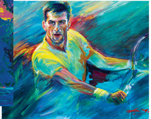
“Novak Djokovic” Lucy McTier, 2019, Acrylic on Metal, 36” x 24”