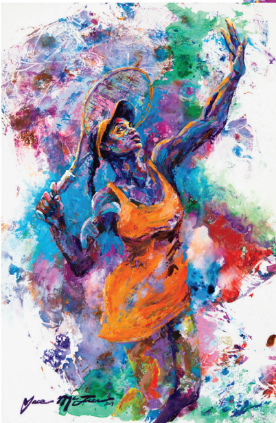
“Sloane Stephens” 2019, Acrylic on Metal, 24” x 36”