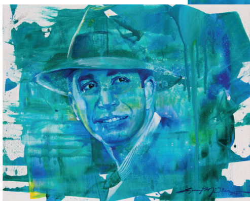
“Carlos Gardel” Lucy McTier, 2019, Acrylic on Panel, 20” x 16”