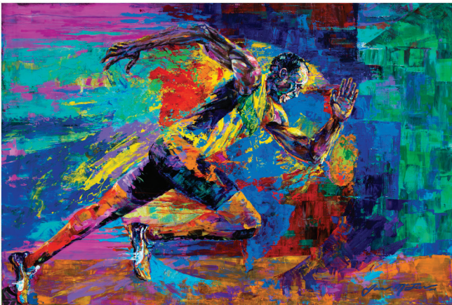
"Time" (Usain Bolt) Jace McTier, 2019, Acrylic on Metal, 60" x 40"