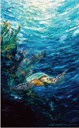
“Hawksbill Turtle” 2016, Oil on Board, 9” x 16”