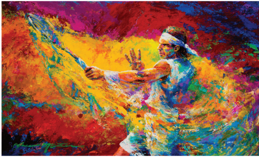
“Duende” (Rafael Nadal) 2017, Acrylic on Board, 48” x 36”