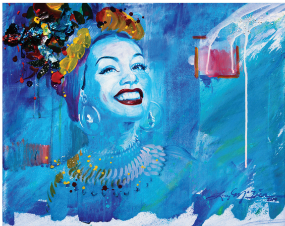
“Carmen Miranda” Lucy McTier, 2019, Acrylic on Panel, 20” x 16”