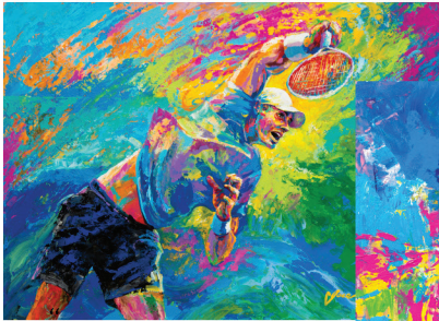
Big John” (John Isner) 2019, Acrylic on Metal, 36” x 24”