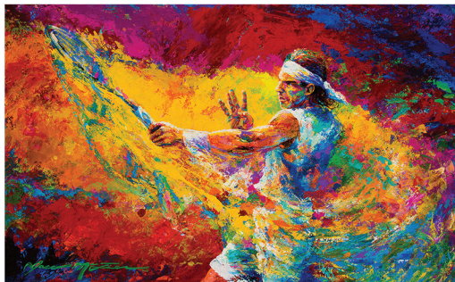
"Duende" (Rafael Nadal) Acrylic on Board 48" x 36"