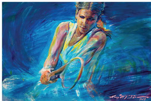
"Chris Evert" Acrylic on Aluminum 36" x 24"