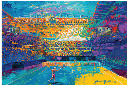
"New Home" (Miami Open 2019) Acrylic on Metal 48" x 36"