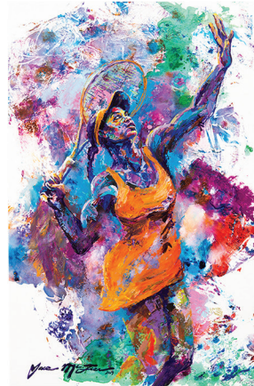
"Sloane Stephens" Acrylic on Canvas 24" x 36"