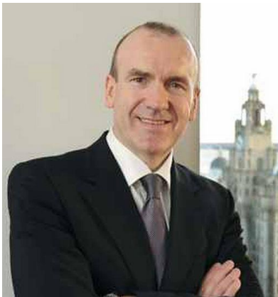
Sir Terry Leahy