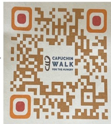
Join "Mother of Perpetual Helpers"

Registration fees are $40 per adult and $25 per child. Online registration closes at Noon on Wednesday, June 5, 2024. After that register at the main gate on Friday, June 14, 2024, starting at 5:30 PM.