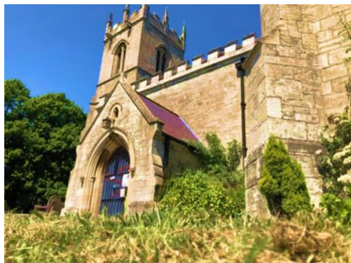
Photo: All Saints Church in all their glory and splendour today.

Me and the angel of All Saints' Church send our love, All Saints xx”