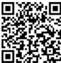
PayPal Scan Code

You can donate to Change for Change or any Social Ministry charities LMLC supports by scanning one of the codes with your smart phone and designating where you want your money to go.