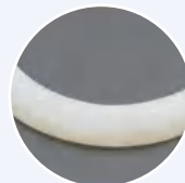
High temperature resistant sealing ring