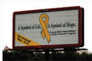
Duluth MN YR Chapter