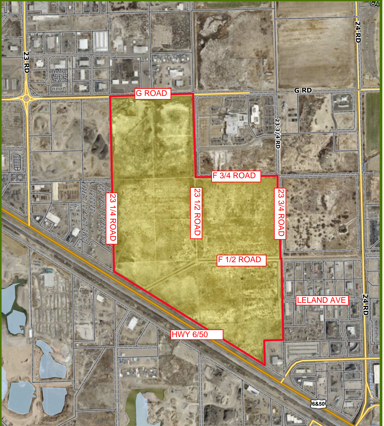
EXHIBIT B - BOUNDARY MAP