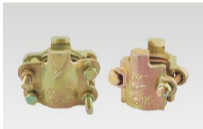
2 & 4 bolt clamp