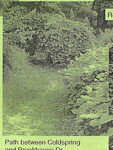
Path between Coldspring and Brookhaven Dr.