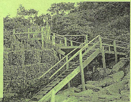
Replaced East Beach Stairs