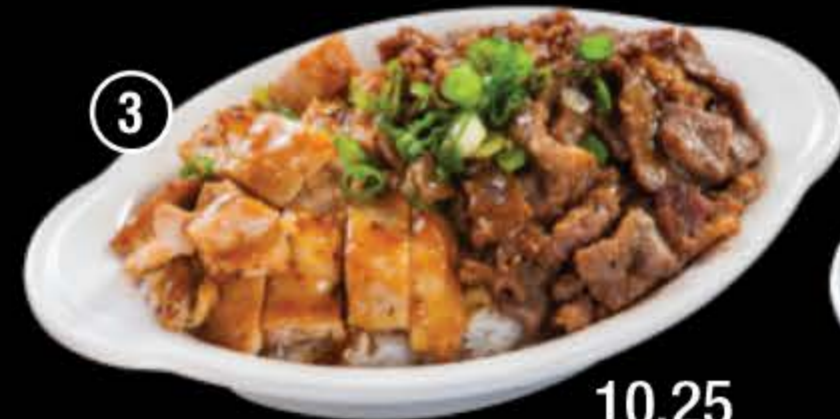
3 10.25 Chicken & Beef Bowl