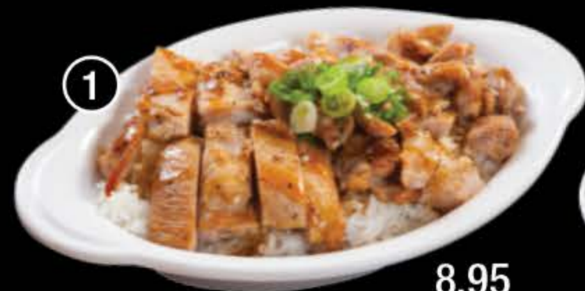
1 8.95 Chicken Bowl