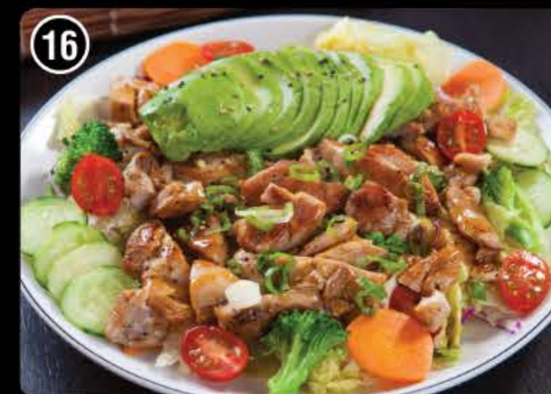
16 13.50 Chicken Salad Plate