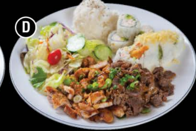
D 15.00 Chicken & Beef Combo Cali Roll (4pcs) + Crunch Roll (4pcs)