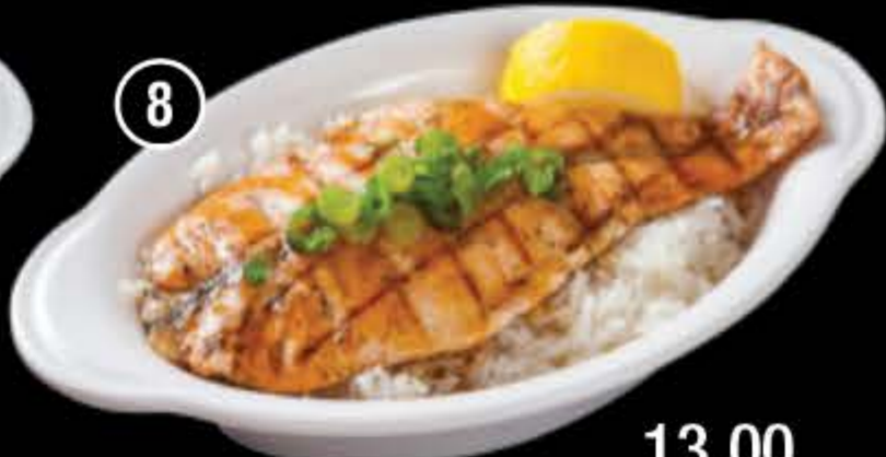
8 13.00 Salmon Veggie Bowl