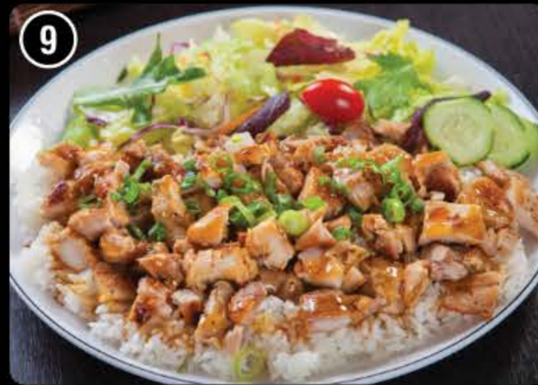
9 11.50 Chicken Plate

Served with Rice & Salad Green Onion, Sauce