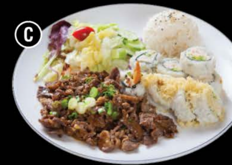
C 15.00 Beef Combo Cali Roll (4pcs) + Crunch Roll (4pcs)