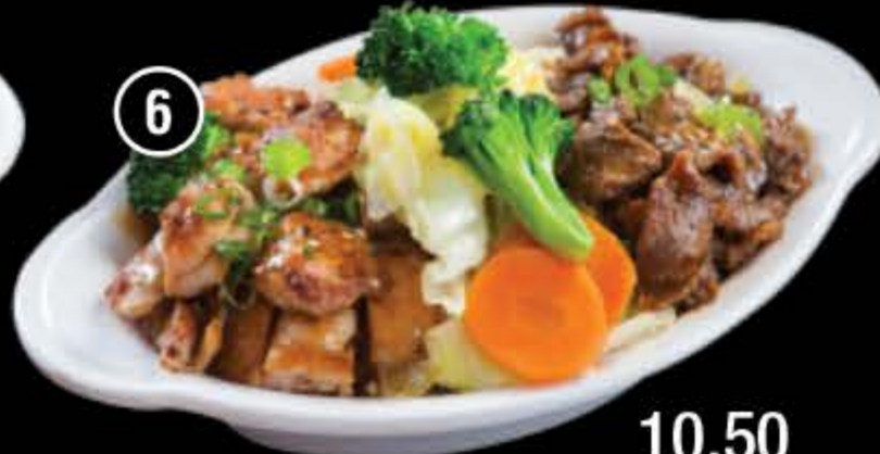
6 10.50 Half-Half Veggie Bowl