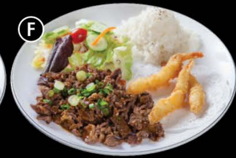
F 15.00 Beef & Tempura Combo Shrimp Tempura (3pcs)