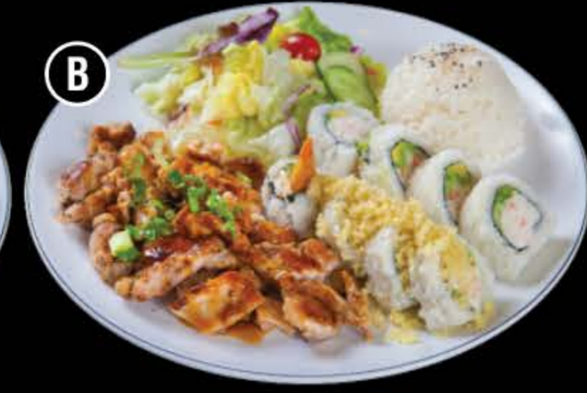
B 14.50 Chicken Combo Cali Roll (4pcs) + Crunch Roll (4pcs)