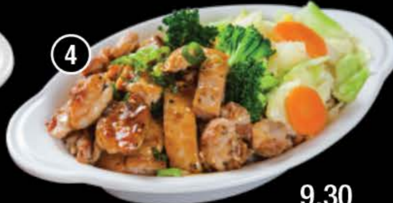
4 9.30 Chicken Veggie Bowl