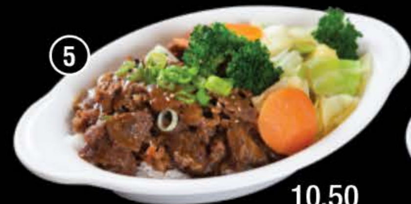
5 10.50 Beef Veggie Bowl