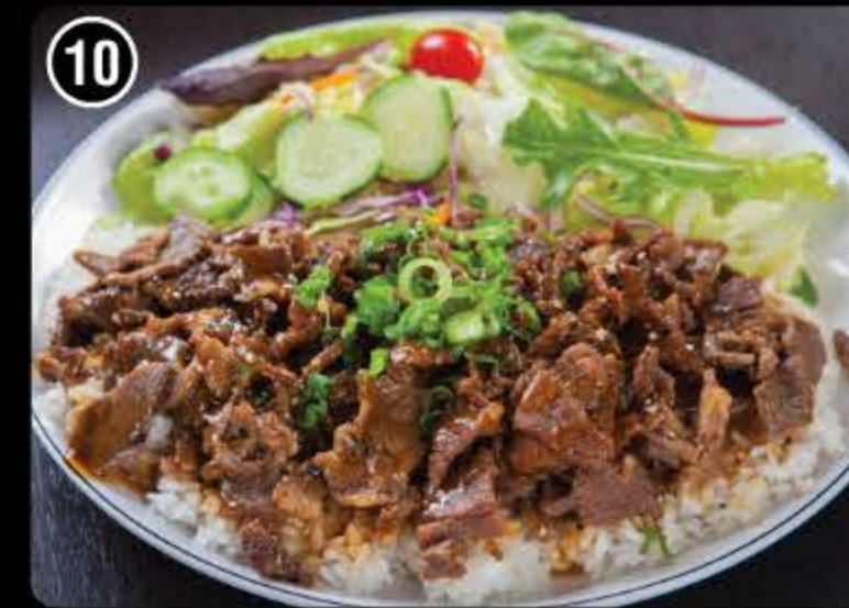
10 12.50 Beef Plate