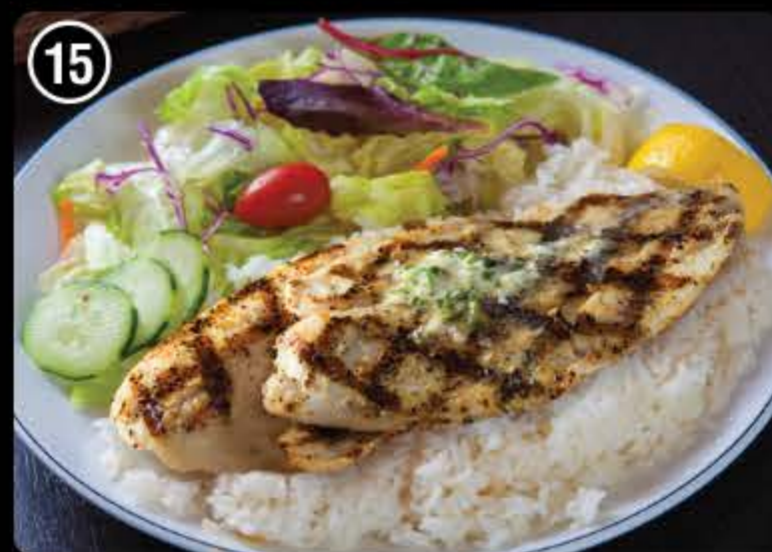
15 13.00 Tilapia Plate