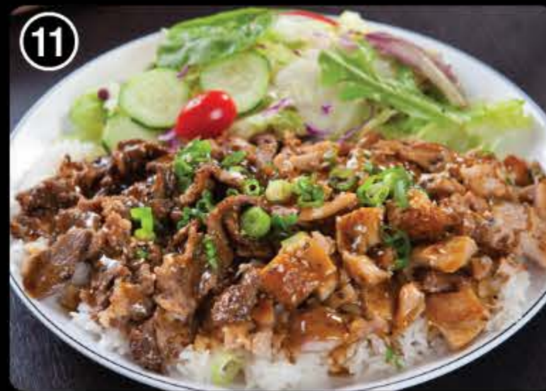
11 12.00 Chicken & Beef Plate