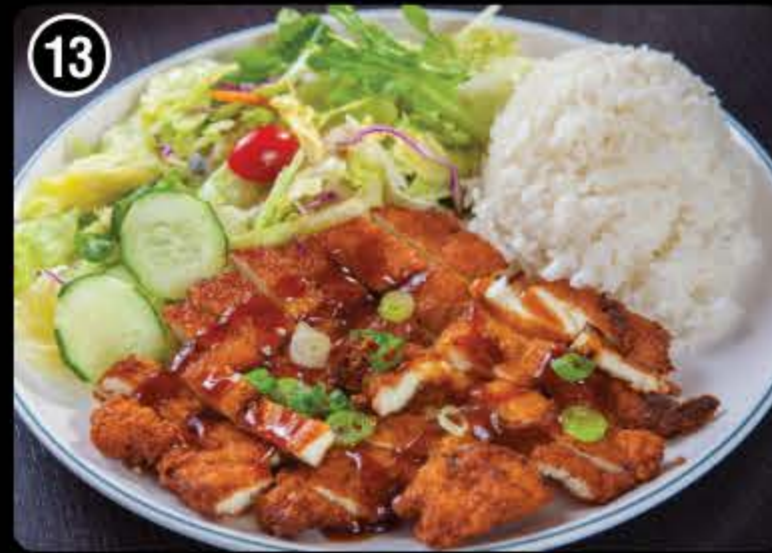
13 16.00 Chicken Katsu Plate