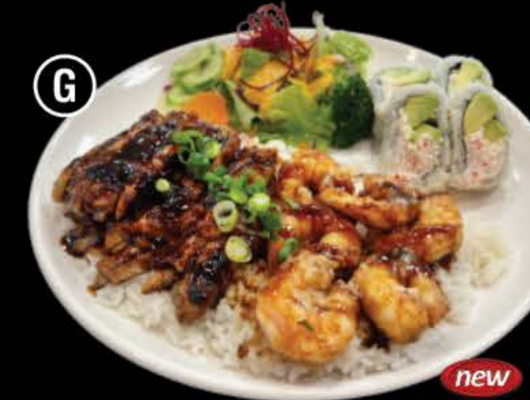
G 16.50 Chicken & Shrimp Combo Cali Roll (4pcs)