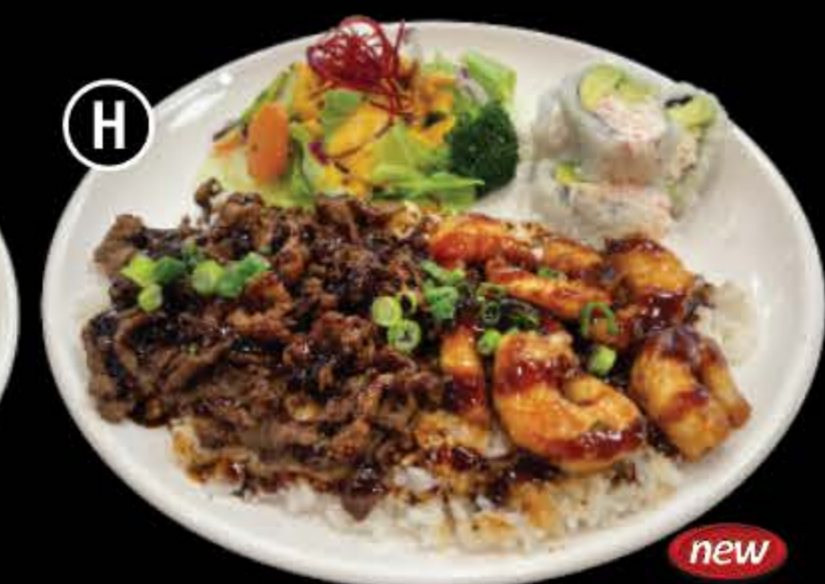
H 17.50 Beef & Shrimp Combo Cali Roll (4pcs)