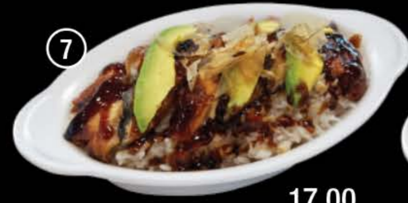
7 17.00 Unagi Bowl