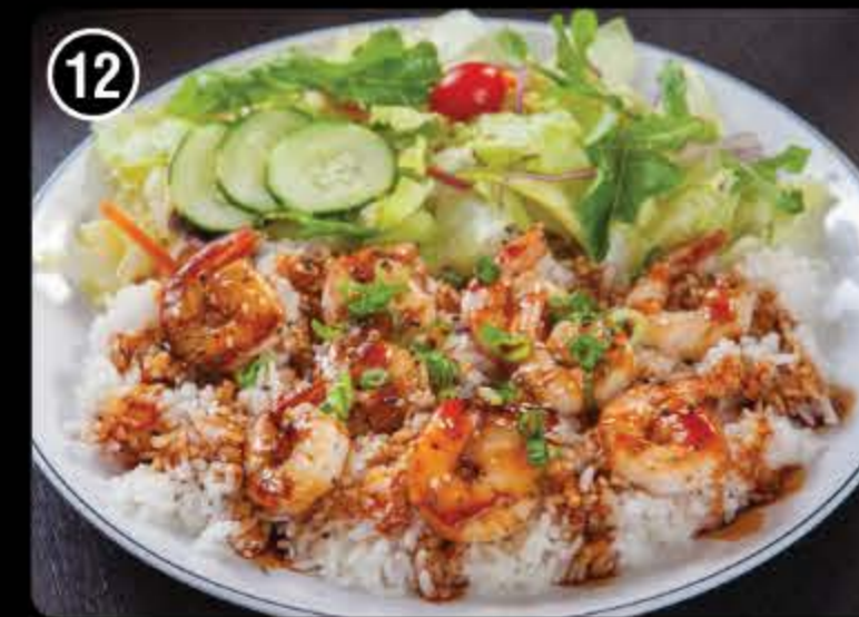
12 14.00 Garlic Butter Shrimp Plate