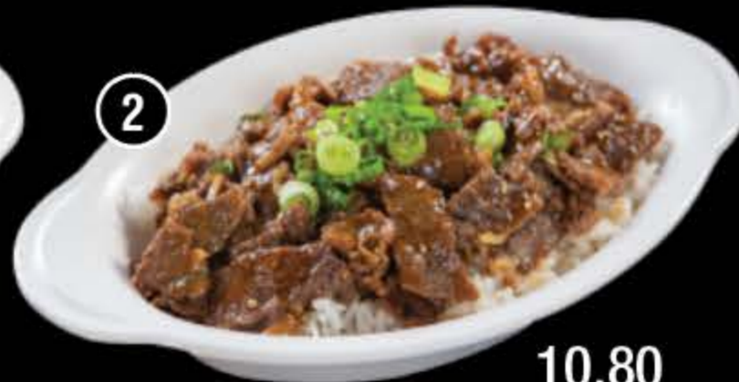
2 10.80 Beef Bowl