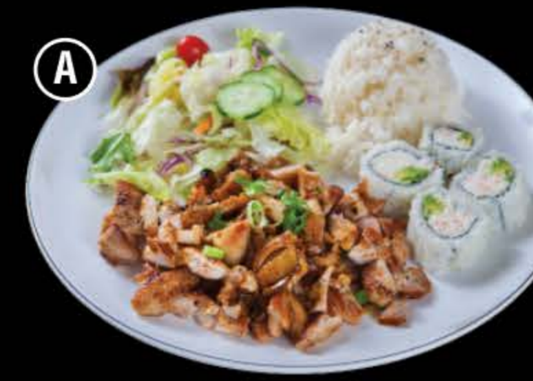
A 13.50 Chicken Combo Cali Roll (4pcs)

Served with Rice & Salad Green Onion, Sauce