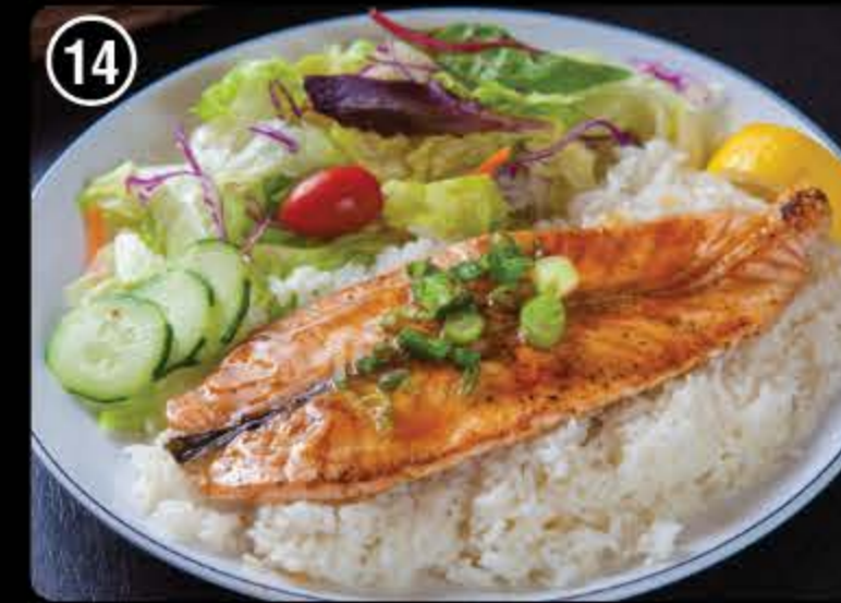
14 15.00 Salmon Plate