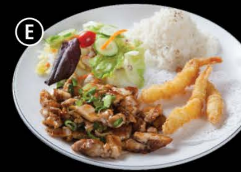
E 14.00 Chicken & Tempura Combo Shrimp Tempura (3pcs)