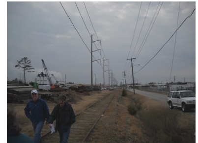
A BTAC board member and Parks and Recreation staff walk along the Norfolk Southern transportation corridor.