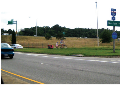
A woman and two children bike along Lynnhaven Pkwy.

Task 7.4.1: Identify departmental liaisons that influence particular aspects of the bikeways and trails plan.