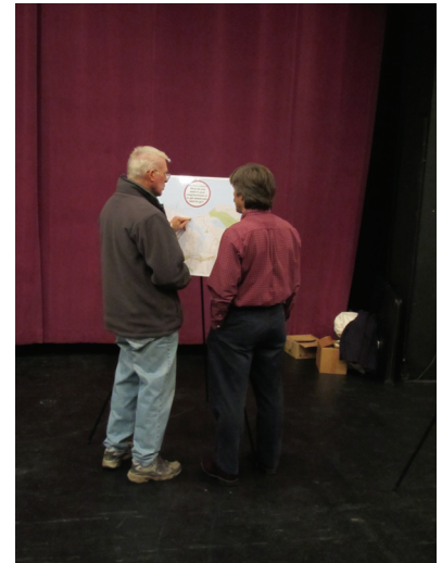
A citizen talks with Parks and Recreation staff about the Bikeways and Trails Plan during a public meeting at the Kempsville Recreation Center.

A comprehensive bikeways and trails system depends on cooperation between City departments and outside agencies. For the summer of 2010, Public Works/Building Maintenance Plumbing Shop used bicycles to get around the busy boardwalk to monitor and service the foot washers, water fountains, and showers. One problem in the past was having maintenance trucks on the Boardwalk with a high volume of pedestrian and bicycle traffic. The bikes came from the Police Department's collection of stolen bikes. The bicycles allow Public Works to be more sensitive to people on the Boardwalk while increasing efficiency and showcasing Virginia Beach's strong biking culture at the Oceanfront. Other City departments are encouraged to follow Public Works' lead to maximize our resources and work together to find solutions that are fun and effective.