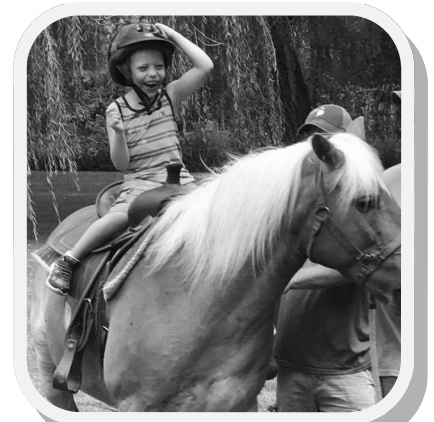
Smiles Were Evident at Pathway Inclusion Center's Family Getaway Camp

This publication shares news about the Ottawa County Community Foundation as we fulfill our mission to serve as a mechanism for charitable giving and enrich the community by assessing and supporting local needs. The Ottawa County Community Foundation is a public charitable foundation affiliated with the Toledo Community Foundation.