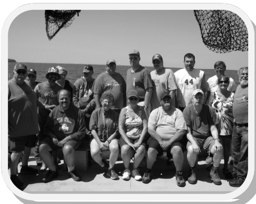
Oak House Members Spent a Day on Lake Erie Honing Their Fishing Skills