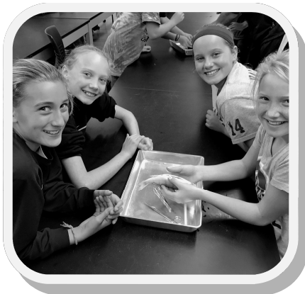
6th Grade Students Enjoyed Hands-on Learning at Stone Lab Field Day