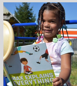
Imagination Library provides books to preschoolers