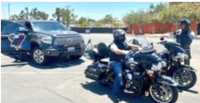
Motors forming for escort