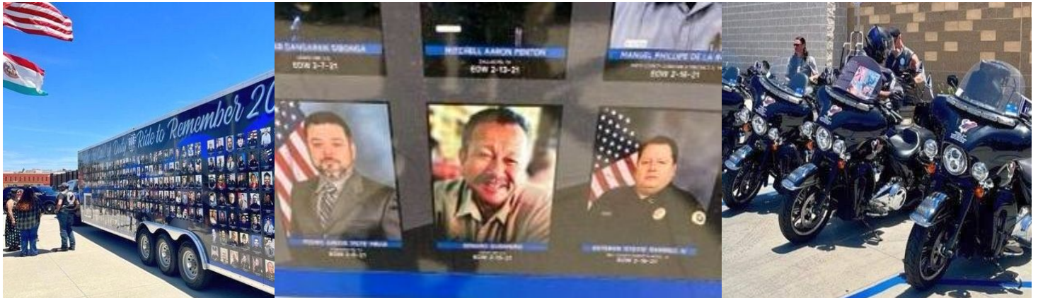
Rolling Thunder Memorial