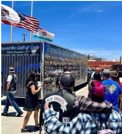
Looking over Rolling Memorial