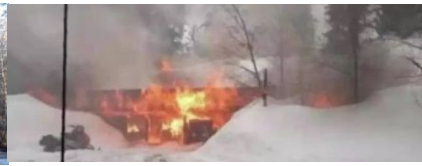
Fire on March 10, 2023