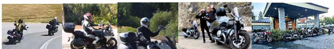
Seen on the road