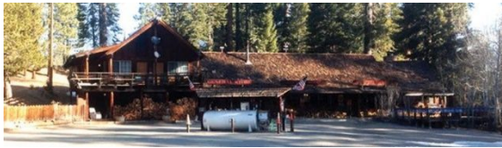
Ponderosa before March 10, 2023

While the experience of riding mountains roads was exhilarating, one site proved to be a depressing visit for us all. The Ponderosa Lodge, a long-time destination for mountain visitors, was burned to the ground. The sight of the ruined Lodge was an epiphany for those who remembered it from past visits.