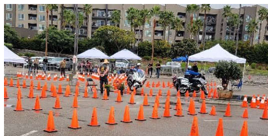
Part of south course

This two-day event is run rain or shine. On the first day, participants could practice the main course as often as they wanted. On the second day, the scored competition included the southern (main) portion and a previously unriden second area on the north side of the field. Riders got one free trip through the pylons, and could buy additional tries for $5. No matter how many runs, their best time was their score for the event, so the more runs the better their chances for winning. All money collected by the SDCOMA goes to charity.