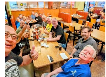
Dinner at Denny's

At the end of each day, we showered and gathered at the Best Western swimming pool area. Libation was shared and the assembled members solved the world's problems with our insightful wisdom. Dinner followed, which was usually at the Denny's Restaurant next door. On one occasion, an attempt was made to visit an Italian Restaurant in Porterville, but was stymied by the lack of public transportation. As responsible adult beverage imbibers, we once again visited Denny's.