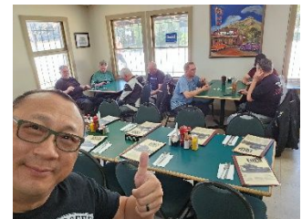
Inside Keene Cafe