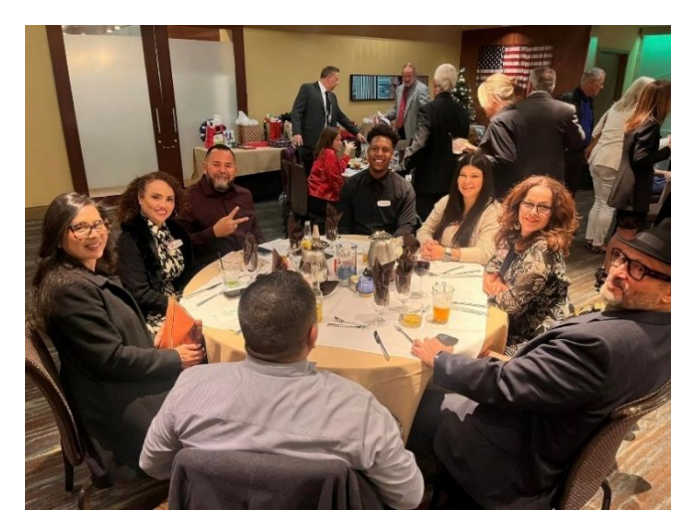
Happiest table in the room