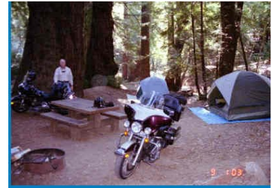
Bruce at Big Sur

Campsite selection: During busy times of the year, I recommend reservations in advance, at least for the first couple of days. I chose two camp grounds on the Internet; one in Big Sur and the other was Richardson's Grove. In each case I made it clear we were on motorcycles in case there were restrictions. When we arrived at each reservation, we were given prime spots that accommodated our tents and motorcycles. For the remainder of the trip we relied upon availability where ever we were when it was dinner time, and we never had a problem.