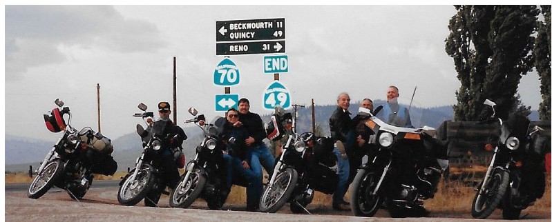
Reaching the end of California Highway 49