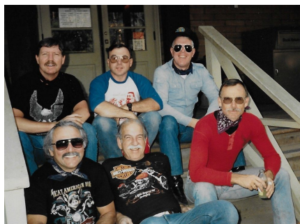
Original Hiway 49 Group

We did stay in motels part of the time, and used the opportunity to do laundry, charge our cell phones and swim in the pool. But we enjoyed the camping the most, and next year we will be emphasizing camping and minimizing motels. Who knows? Someday we may perfect our camping luxuries and save the motel money for other things. Like a thermos for hot coffee.