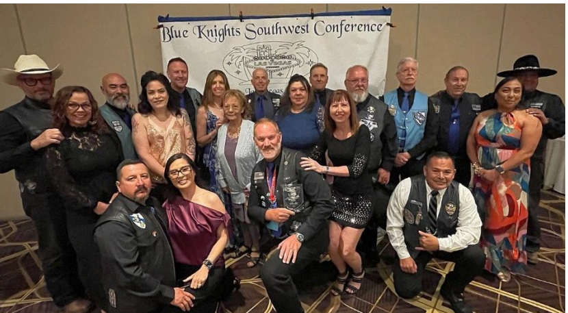
California 6 with ladies