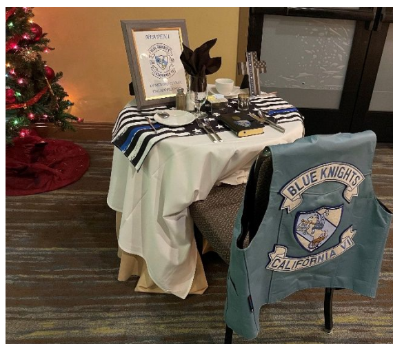
Heaven I Table