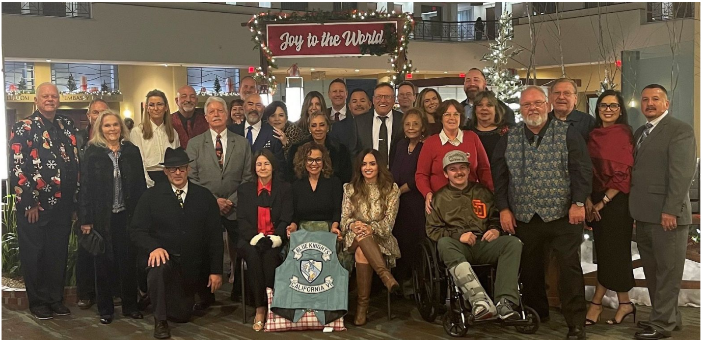
Sharing the Spirit