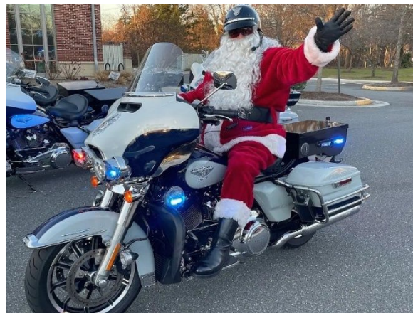
(This is not me)

Having said all that, I wish for you the best of the holiday season and a prosperous New Year. I am grateful for my 32 years as a Blue Knight, and the opportunity to serve as a Director, Safety Officer and Newsletter Editor for our Chapter.