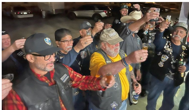
Thank you, California X

Many thanks to all of CA X Lady Knights for their delicious cooking skills and work behind the scenes. Also, to the Imperial County Sheriff’s Office Explorers Color Guard. The Blue Knights exemplify what a family-friendly fraternal charitable organization is all about. Ride with Pride.