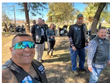
California VI members

On October 29, 2022 California Chapter Ten (CA X) hosted their 26th annual Poker Run in Imperial County at the beautiful Desert Trails RV Park and Golf Course. Much like years past, CA X, and their family members outdid themselves with clubhouse cocktails, free Mexican style breakfast, included BBQ-rib lunch, a pleasant 60-mile Poker Run route, and three different raffle drawings.