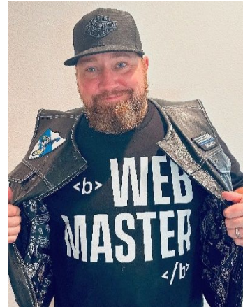
The Man; The Master