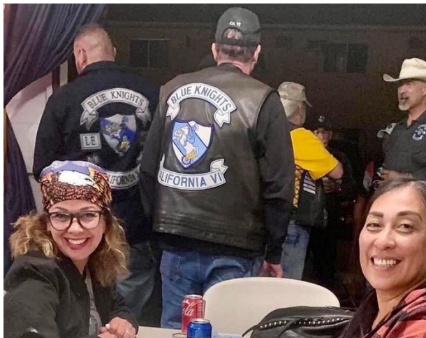
Blue Knights and Knight's Ladies in attendance