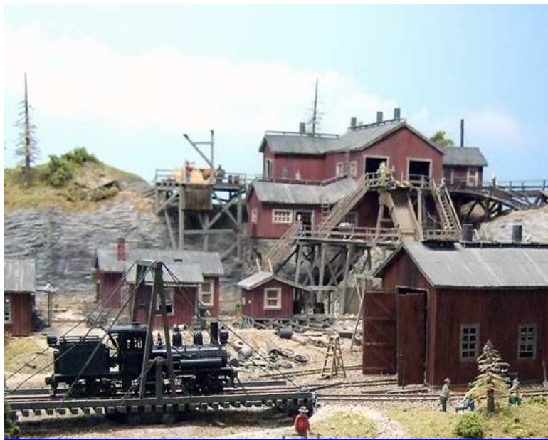
West Virginia coal mining as it was.