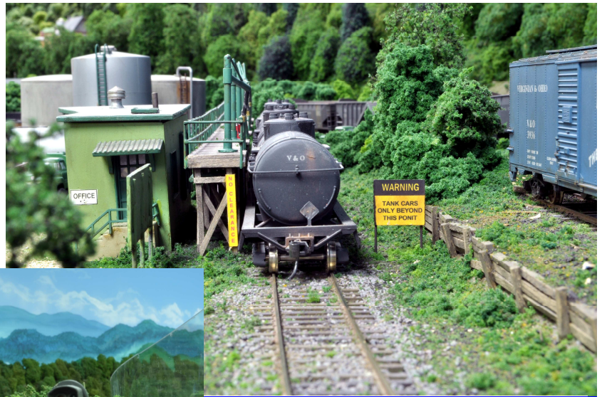
Backside of the Scott Firth Oil Depot