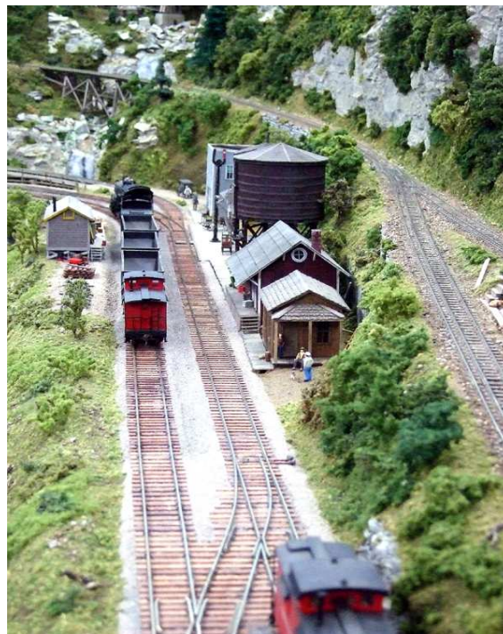
The standard gauge C&O hugs the river as the narrow gauge Mann's Creek Rwy. climbs out of the valley.