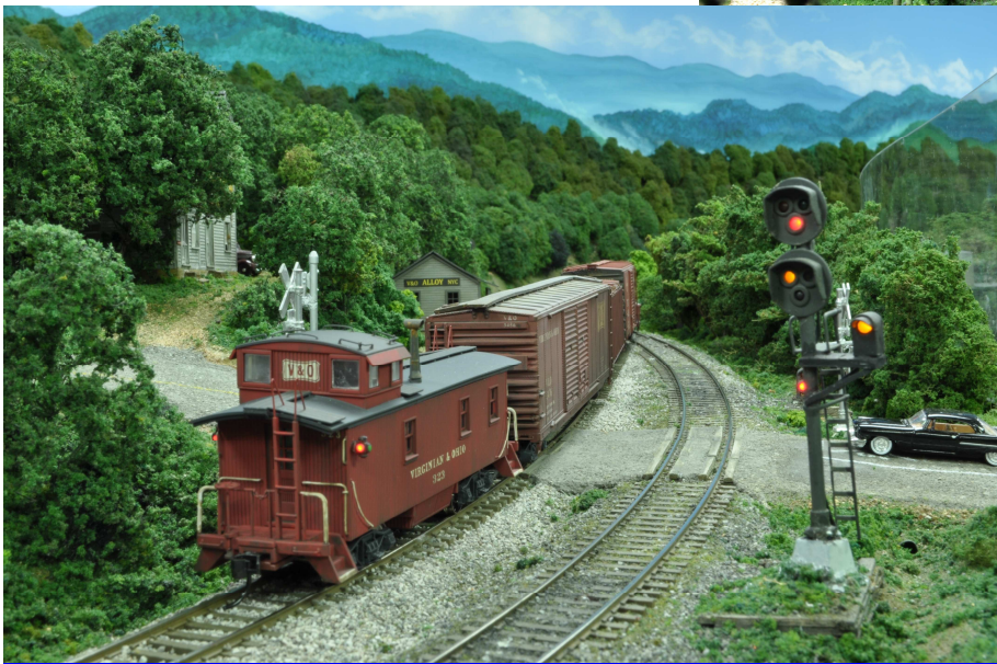
A V&O freight clears a rural crossing on Gerry's layout