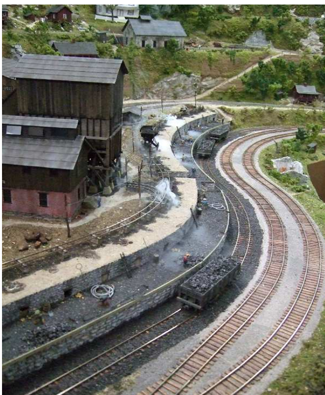
The smoke coming from the coke ovens tells us it's a busy time for the Mann's Creek Railway.