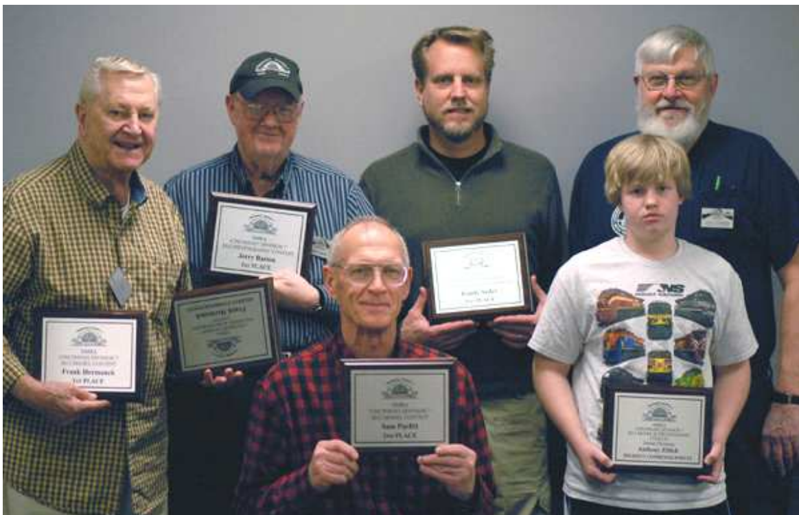
The 2012 Competition Winners (Where's Georgia?)