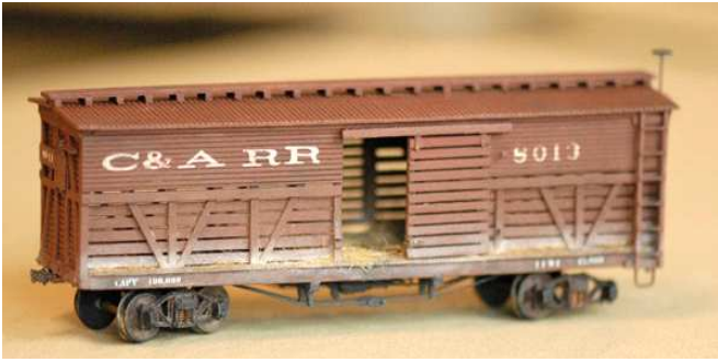
1st Pl. Box Stock Chuck Endreola