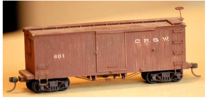
1st Pl. Kit Bashed Butch Sage