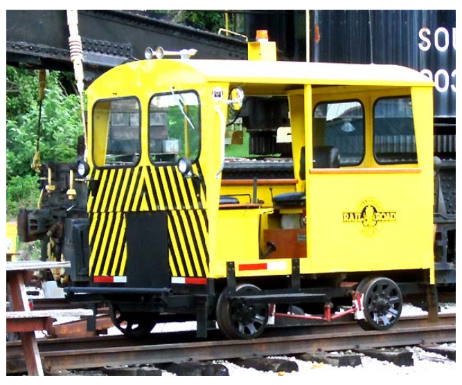
Neat little Critter