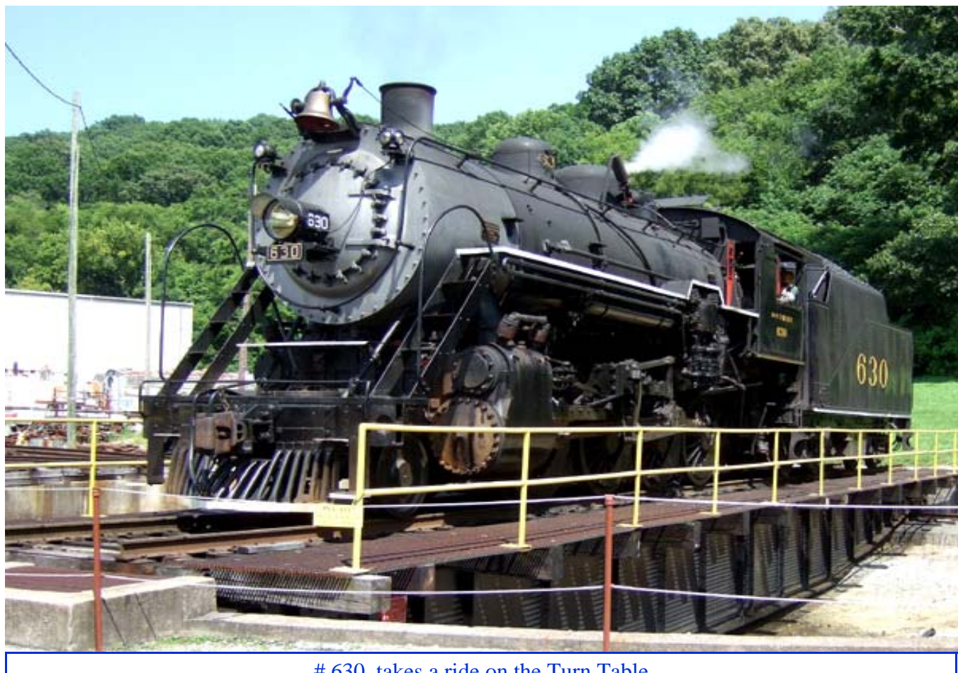
# 630 takes a ride on the Turn Table