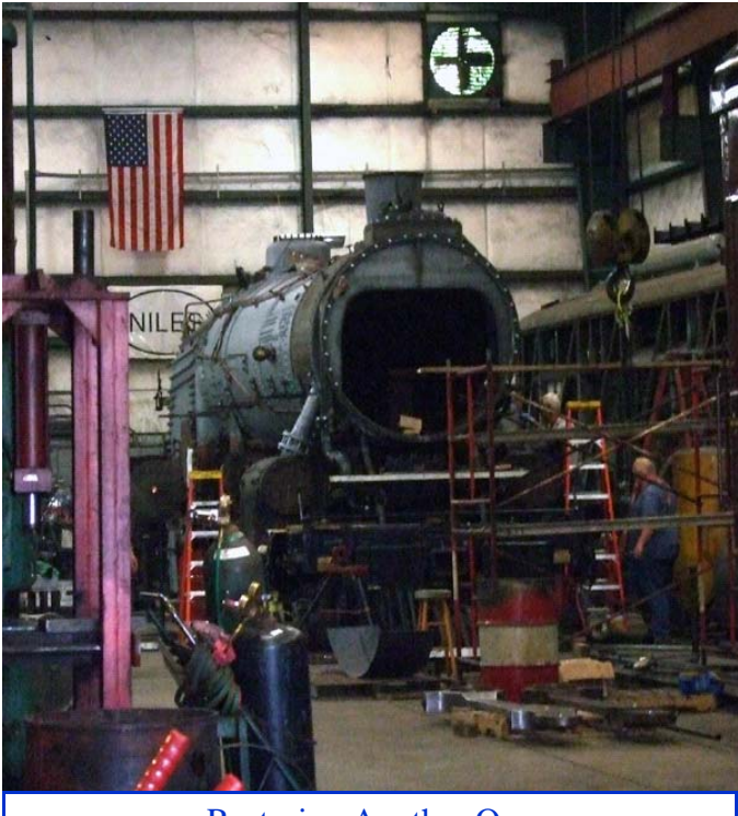
Restoring Another One