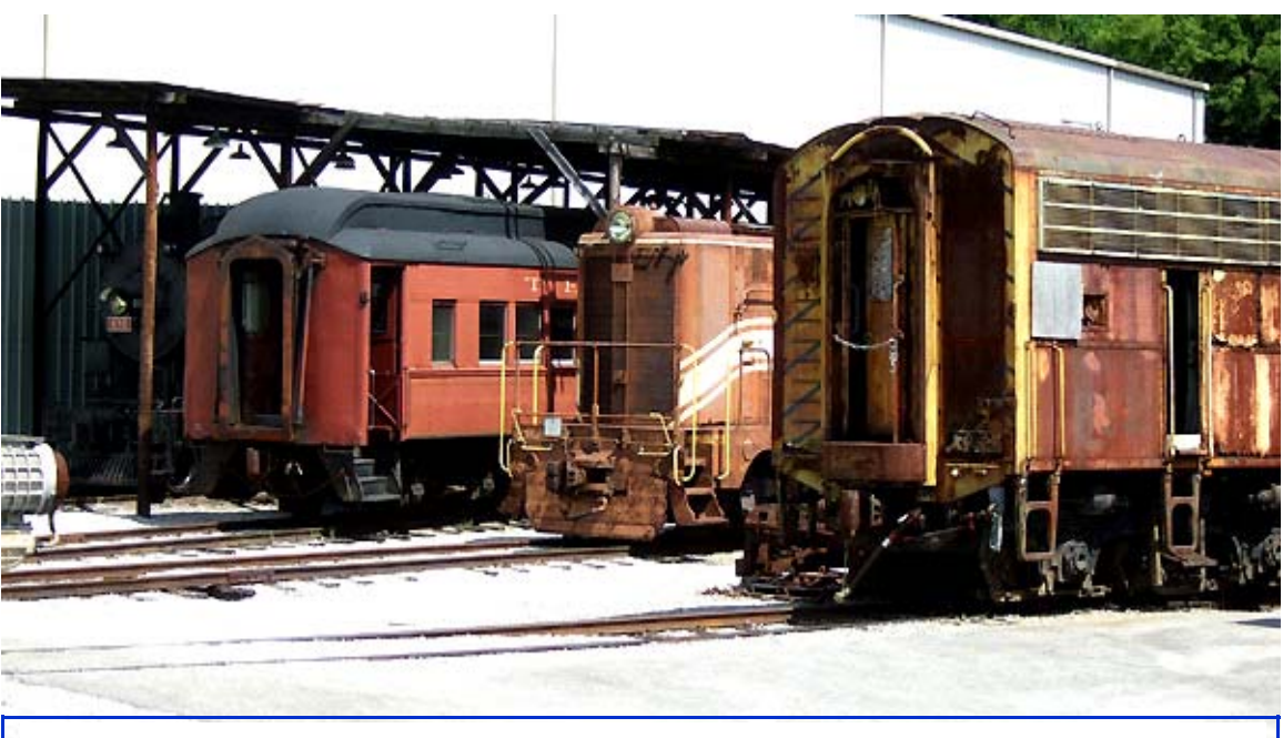
Waiting their turn to be restored