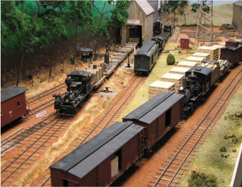
← Birdsong's On3 Logging Layout