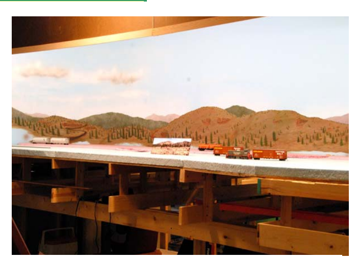
Dan Hadley's Layout