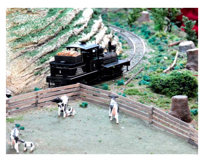
Cincinnati Model Railway Club