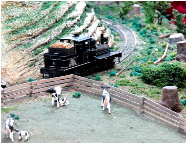
Cincinnati Model Railway Club