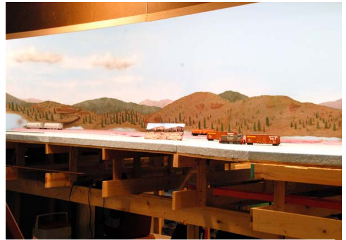
Dan Hadley's Layout