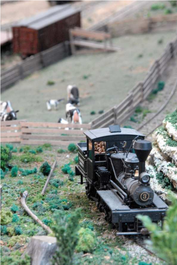
Another Trip Up the Hill for Shay # 3 to bring down a string of log cars on the On30 branch line of CMRC's O gauge layout