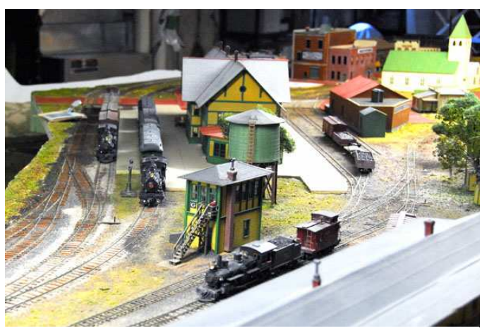
Pat Homan's Layout