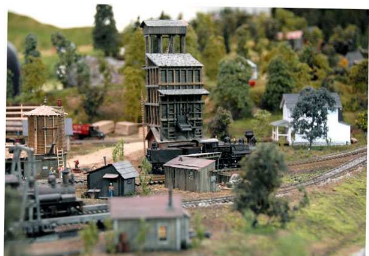
Fred Plymale - HO Layout