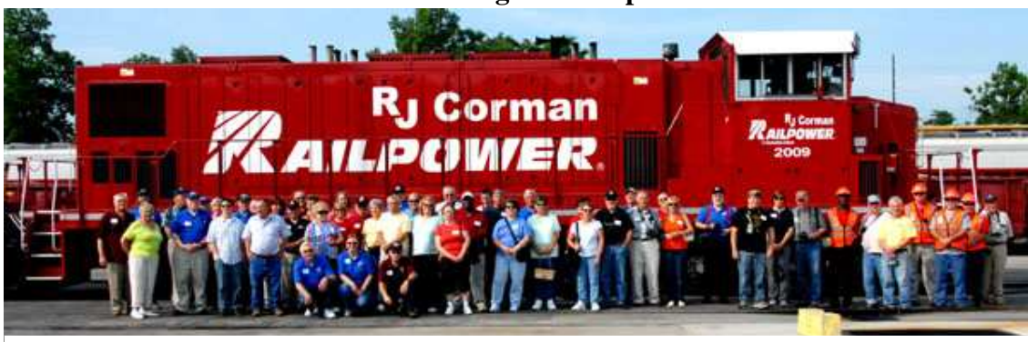
Division 7 & Guides at Corman Shops