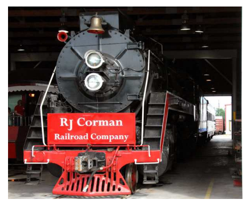
Chinese Choo Choo