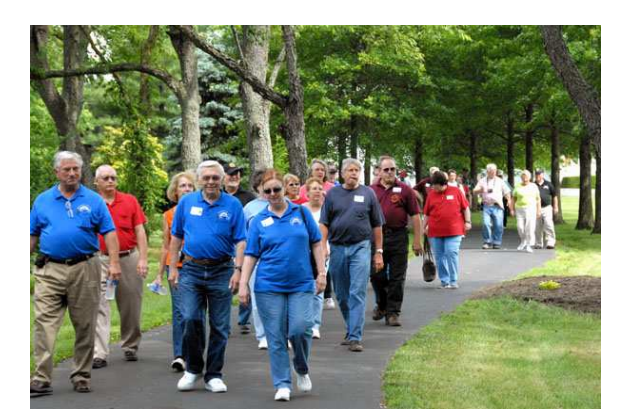
Hi Ho, Hi Ho