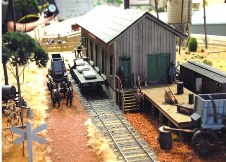
Pete Birdsong, MMR - On30 Layout