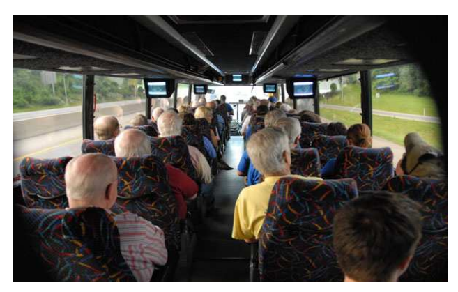
On the road again