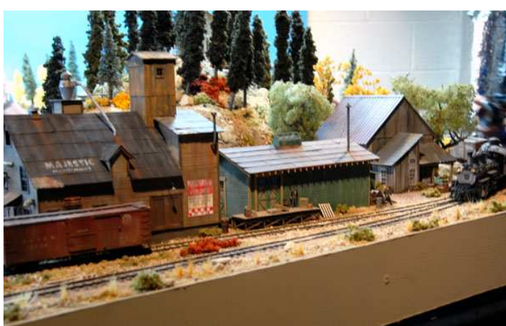
Pat Gerstle's - Sn3 Layout