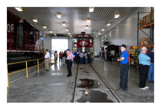
Checking it out