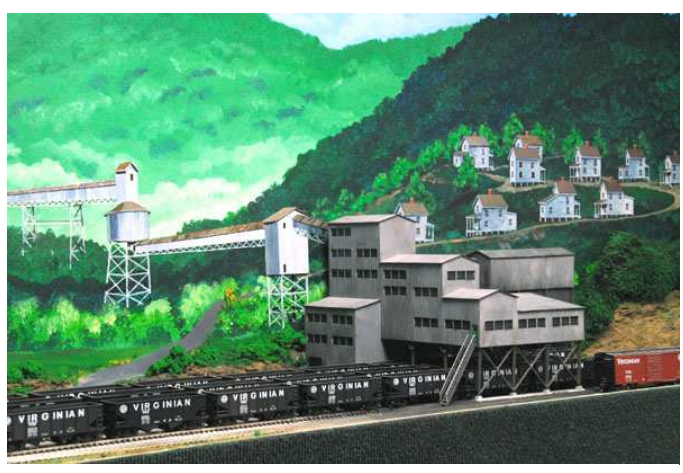
Gerry Albers' Layout