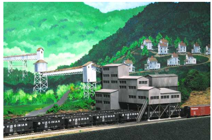
Gerry Albers' Layout