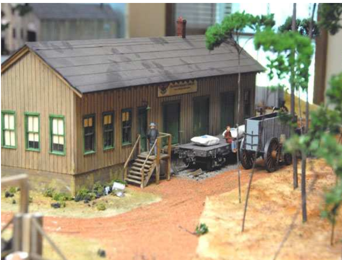
Pete Birdsong, MMR - On30 Layout