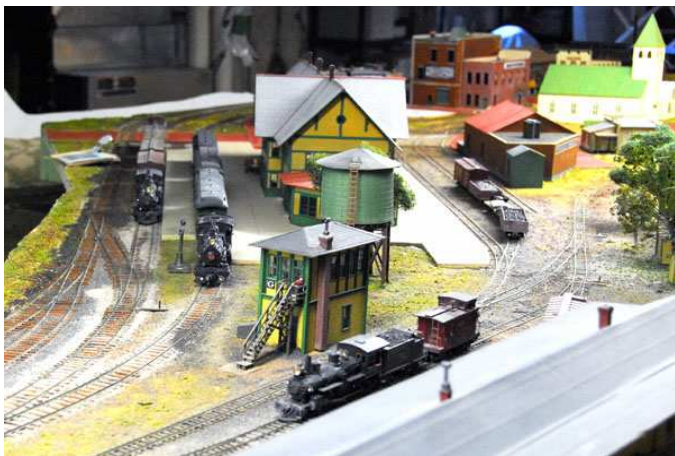
Pat Homan's Layout