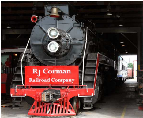
Chinese Choo Choo