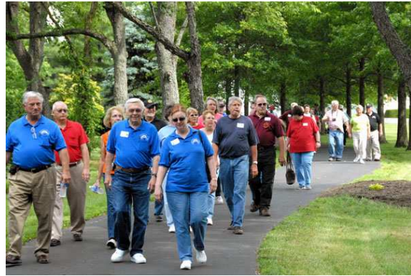
Hi Ho, Hi Ho