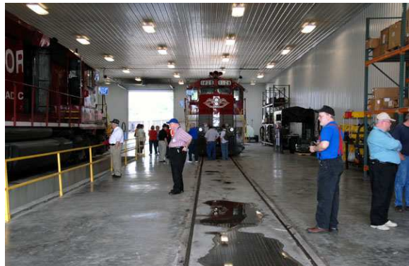
Checking it out