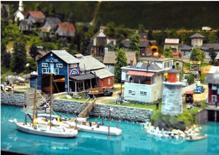
Fred Plymale - HO Layout