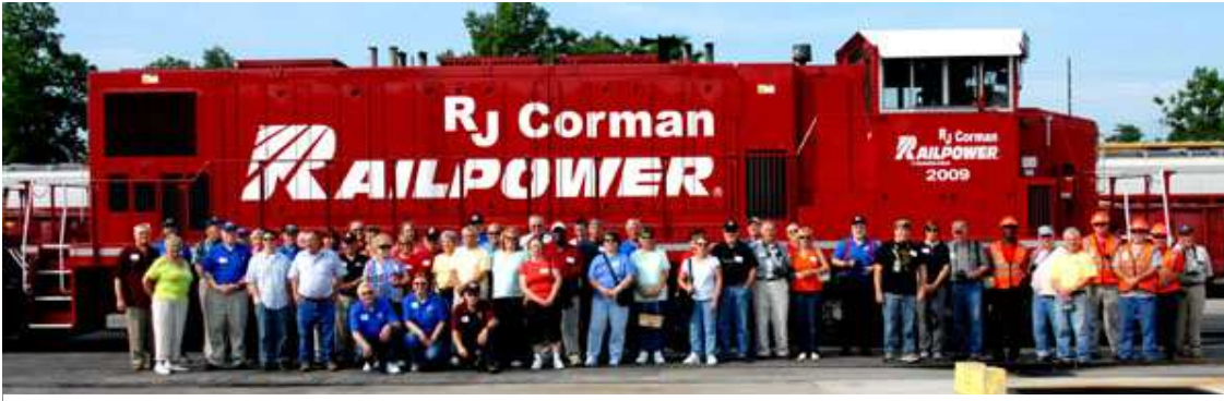
Division 7 & Guides at Corman Shops