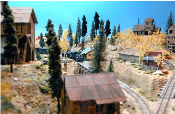
Pat Gerstle's - Sn3 Layout