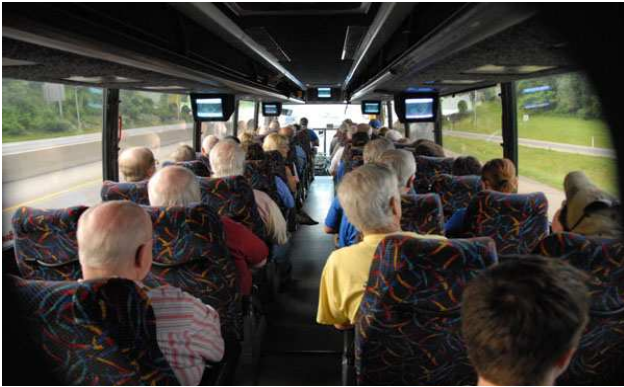
On the road again