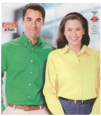
Men's Shirt Ladies Shirt

adjustable cuffs, 6.5 oz., 65/35 poly/cotton, stain and wrinkle resistant, fully buttoned front, soft touch finish