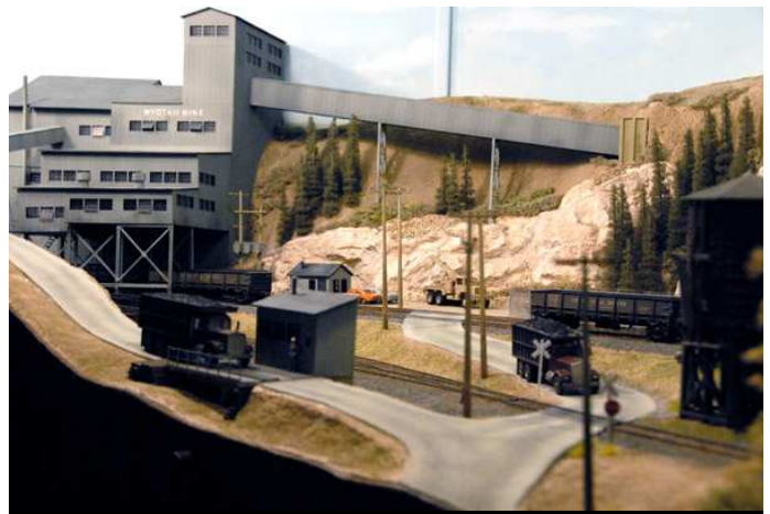
Busy mine scene on Don Leedy's HO layout