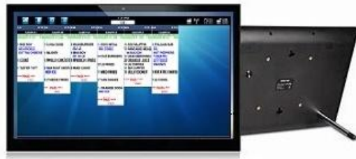
ChefTab 14" Tablet