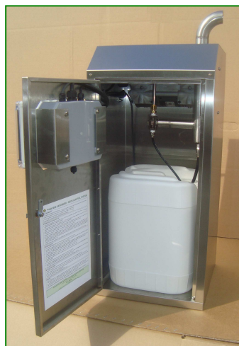
High Quality Components