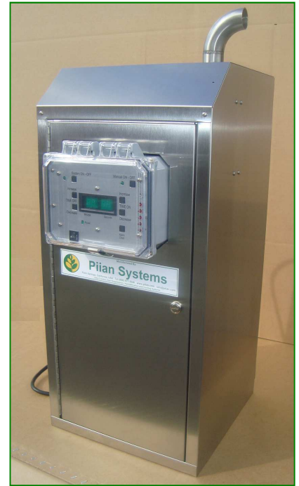
Odor Neutralizing Vapor System

Lifetime Warranty – If it ever breaks there are no repair costs to you.