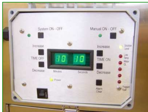
Easy To Use Digital Control Panel

All Natural Piian Odor Neutralizing Vapor – Effective, Safe, Environmentally Friendly.