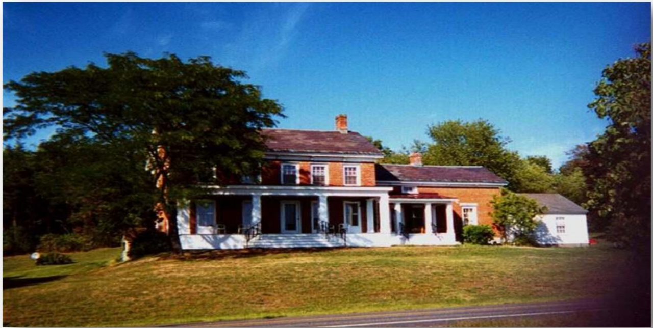
Argyle, NY: Lemuel Carl House, ca. 1838