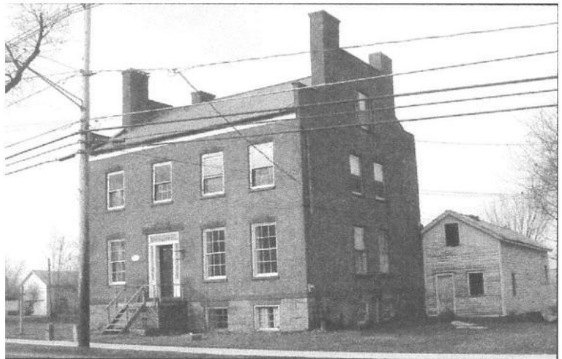
The Ransom Stiles House