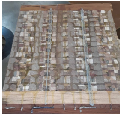
Glued up cutting board prior to flattening

The sled must be used before using the drum sander for skimming and flattening both sides of your workpiece and to remove glue runs and dags. Once that is done, then move over to the drum sander to complete your sanding.