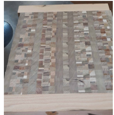
Glued up cutting board after flattening