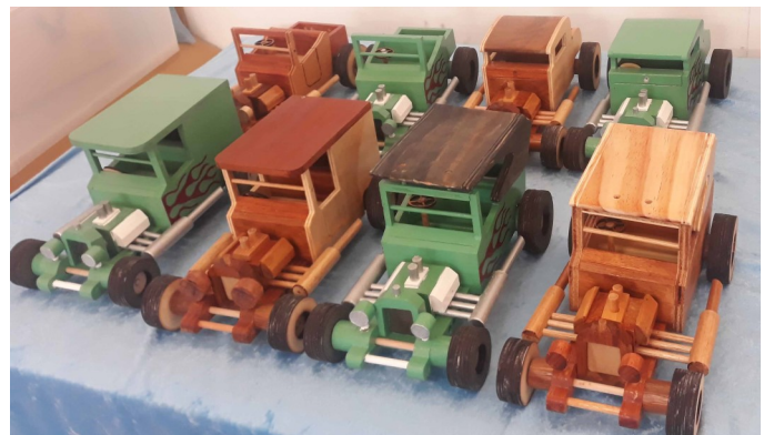
Jalopies seen in the Gallery. I suspect I know who made these!