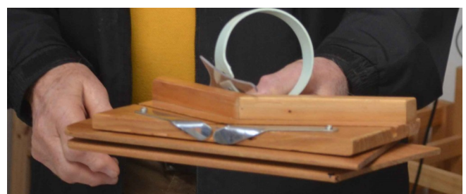
Above is the collapsed recipe book holder.

The final gadget to hold the pages open, I made from a piece of 90mm PVC tube and a piece of polycarbonate. All good and I am looking forward to another thank you."