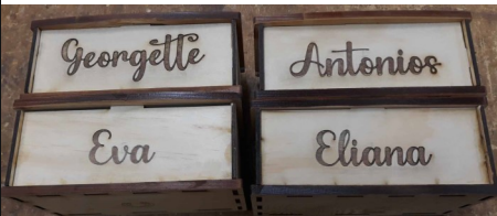
The four names were engraved on the front of the boxes.