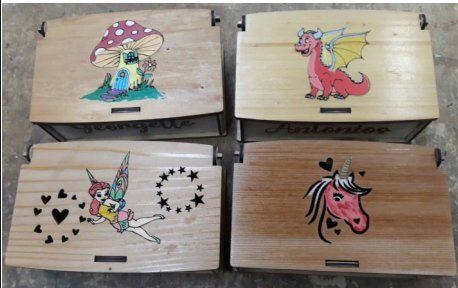
These are the tops of the four boxes.

Of course, the Club was up to the request. The photos below show what we promptly produced.