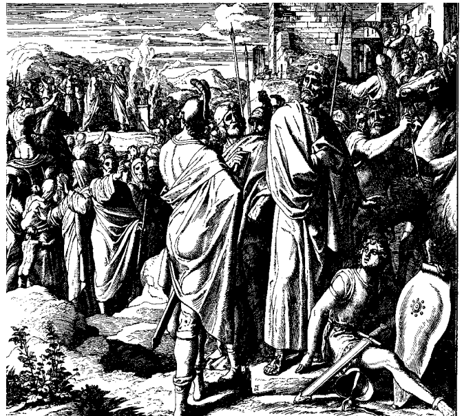
Woodcut illustration by Julius Schnoor von Carolsfeld (1794-1872)

From that time, the light of God in the house of Israel was replaced with darkness and