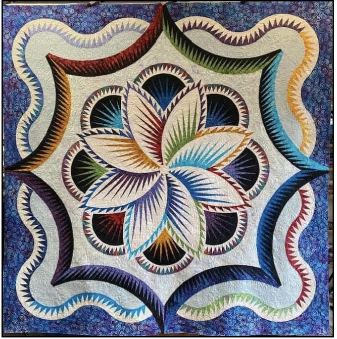
<u>Ruthie Reynoso</u> made this "Rainbow Hosta" quilt (photo courtesy of Coastal Stitches, who quilted it).