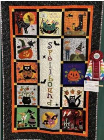
"Spellbound," Konnie Glaze, 2nd Place, Wool Work