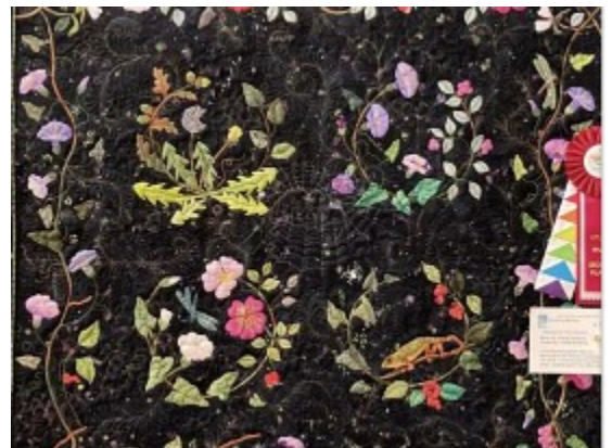
"Midnight, Garden," Kathy Bradbury, 2nd Place, Applique