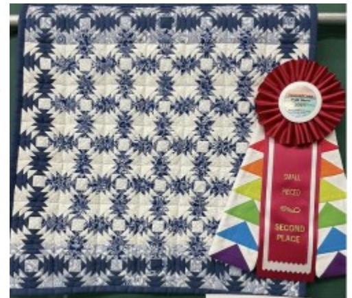
"Mini Pineapples," Bil- lie Morrison, 2nd Place, Small Pieced