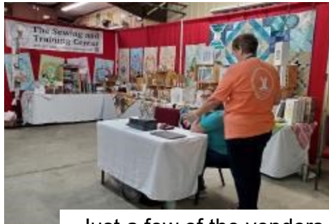
Just a few of the vendors