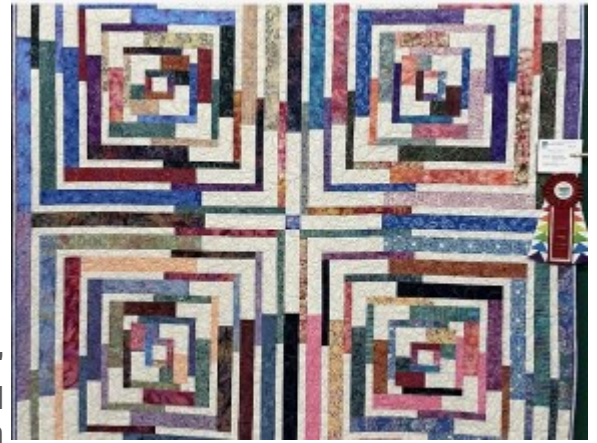
"Antelope Canyon," Ruthie Reynoso, 2nd Place, Modern