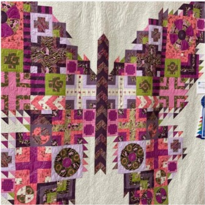
"The Butterfly Quilt," Loraine Acosta, 1st Place, Modern