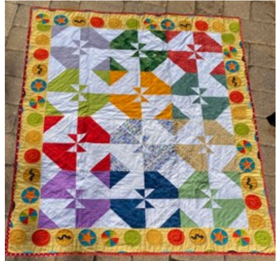
45" by 55" quilt