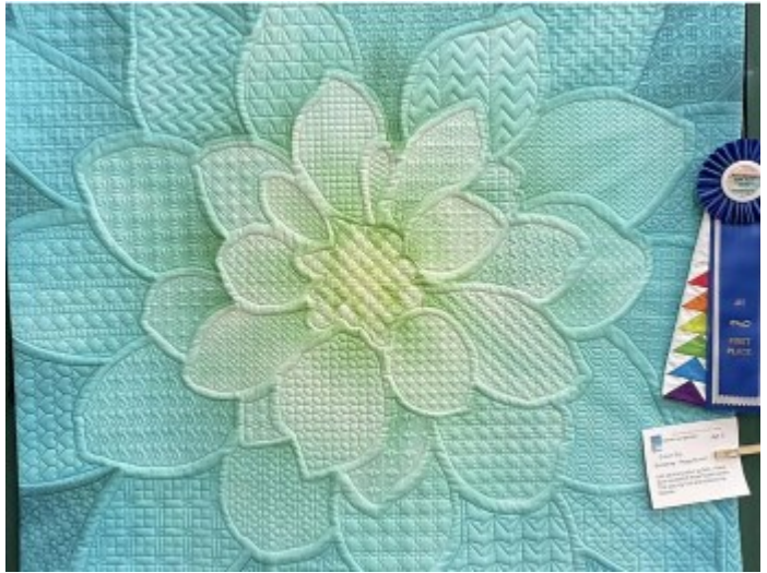
"Dream Big," Peggy Murrell, 1st Place, Art