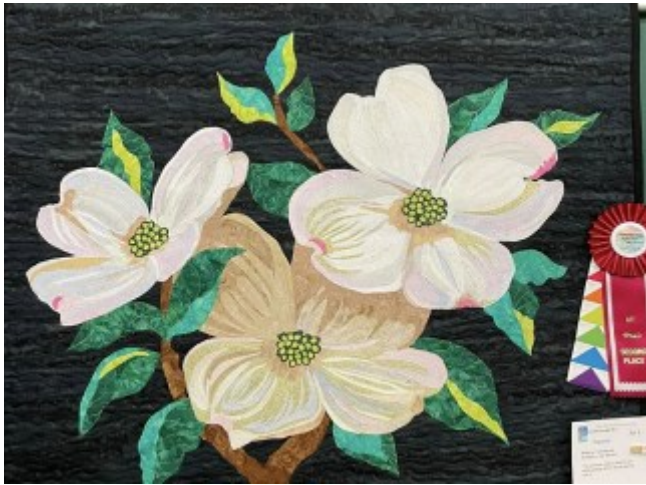
"Dogwood," Gail Menard, 2nd Place, Art