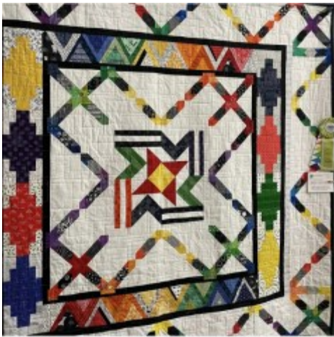
"Box of Crayons," Loraine Acosta, 3rd Place, Modern