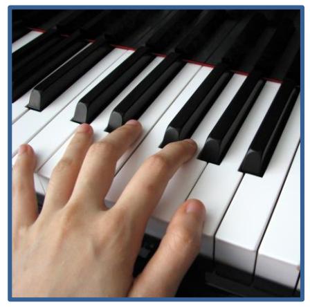
From one grateful parent:

Students in the program will also get the opportunity to experience a dress rehearsal for one of our Symphony concerts and receive tickets to attend a concert with their families