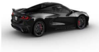
2023 Black Corvette Convertible 5/18/2023

Check out some of the past raffle winners at