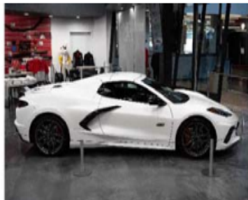
2023 70th Anniversary Convertible VIN 00002 4/28/2023