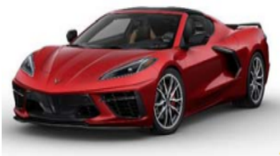
2023 Red Mist Corvette Coupe 4/20/2023