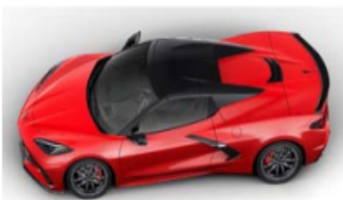
2023 Torch Red Corvette Convertible 4/29/2023