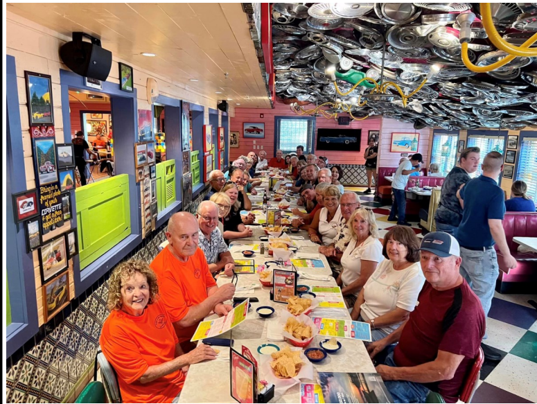
Day 4, Saturday, drive home.