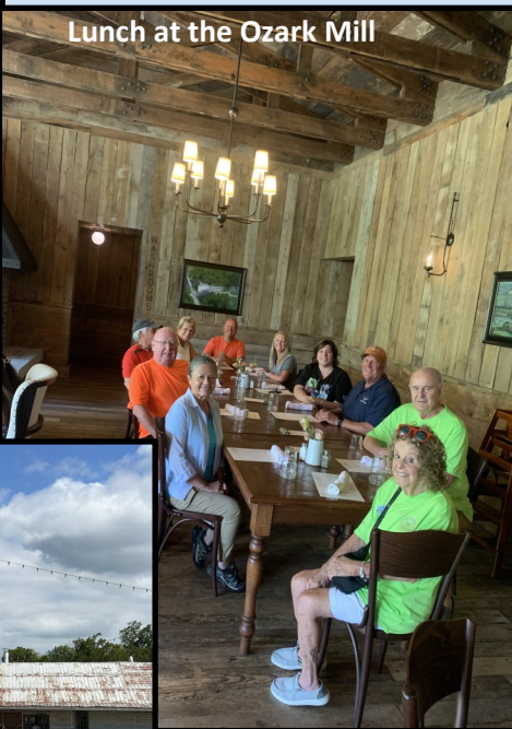
Lunch at the Ozark Mill

The Saturday evening awards banquet churned out even more LOCC winners! The Tostenrud's won a free night's stay at the hotel, redeemable for that weekend. What a deal! Once everyone dined on pot roast, pulled pork and all the sides and included desserts it was finally time for the awards ceremony. With all LOCC attending members receiving an award, the evening ended perfectly! The LOCC results are noted as follows: