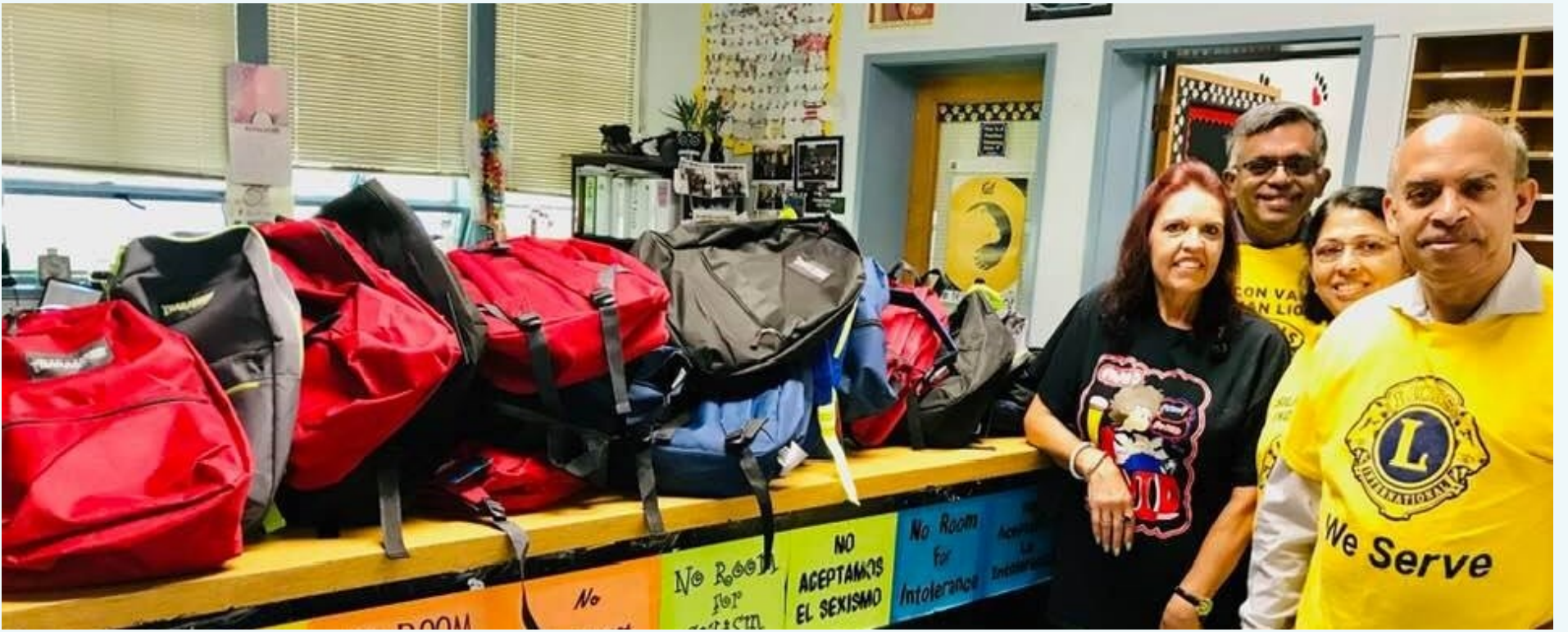
Backpack distribution to local schools.