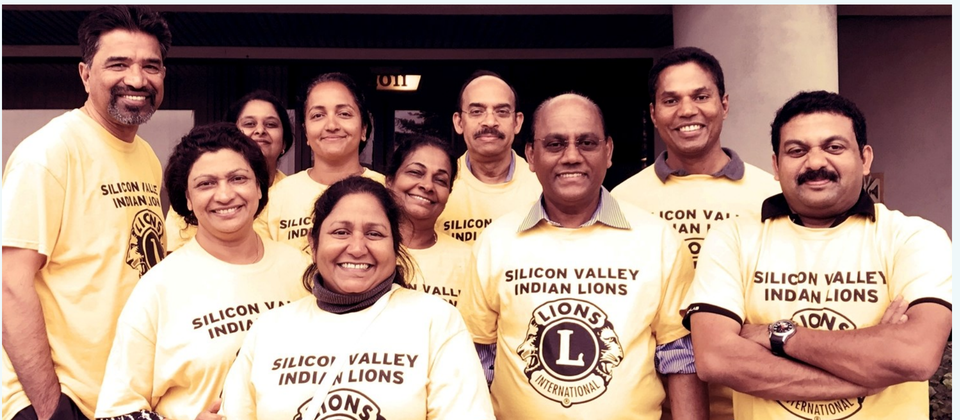
Volunteering to provide food to homeless