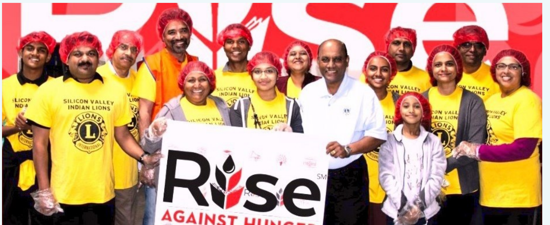
Rise Against Hunger Project