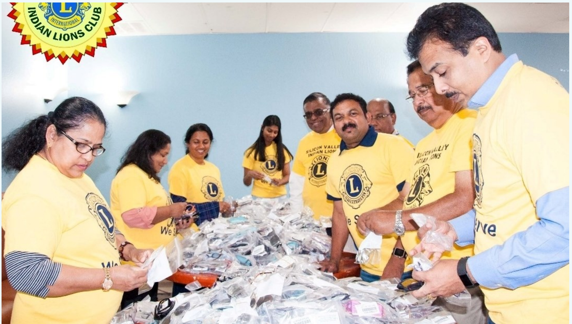
Sorting out Eye Glasses for medical mission