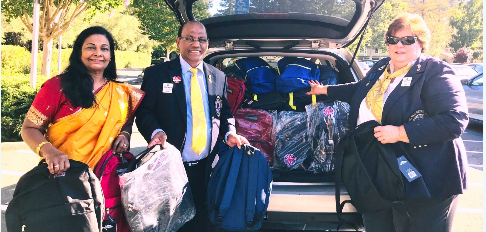
100 backpacks with school supplies donated to Fire affected Paradise Schools.