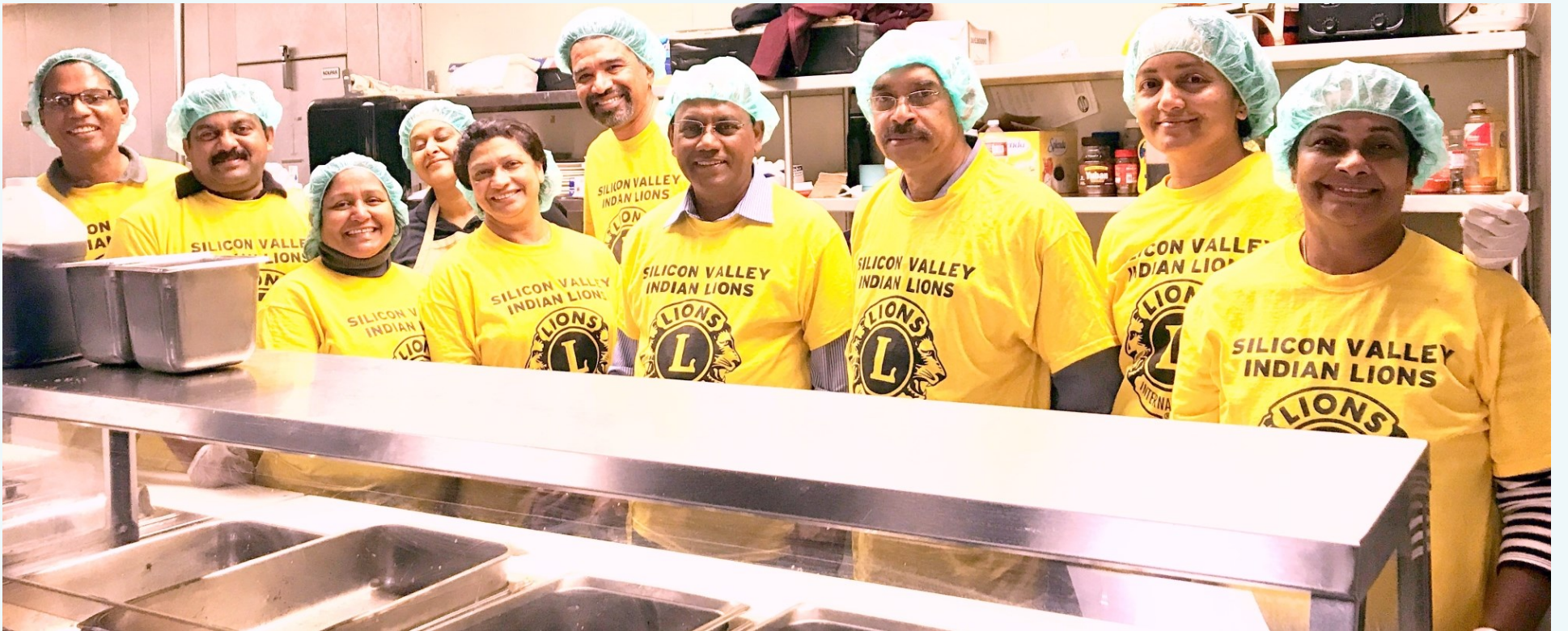
Cooking for Homeless