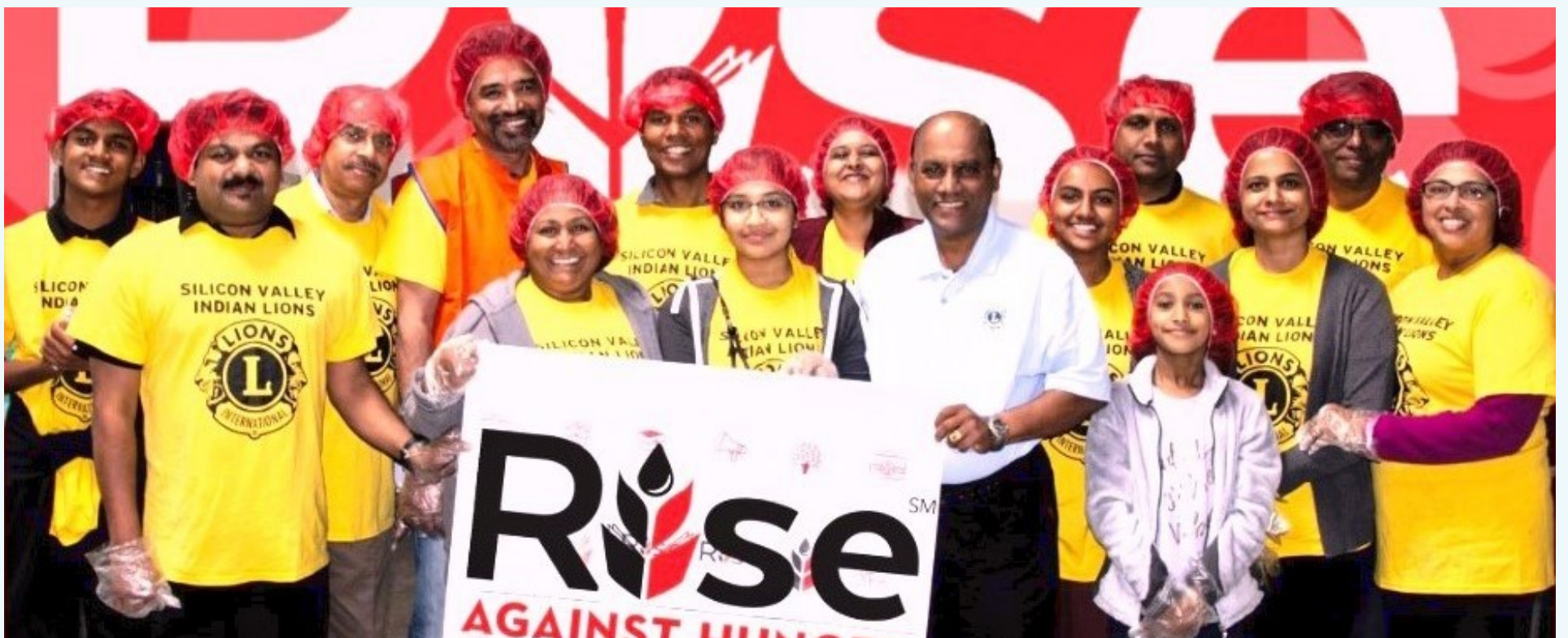
Rise Against Hunger Event