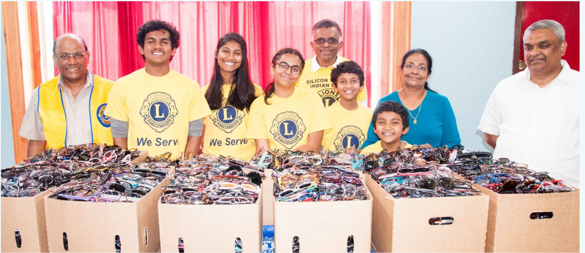
Eye Glass Sorting for future medical mission