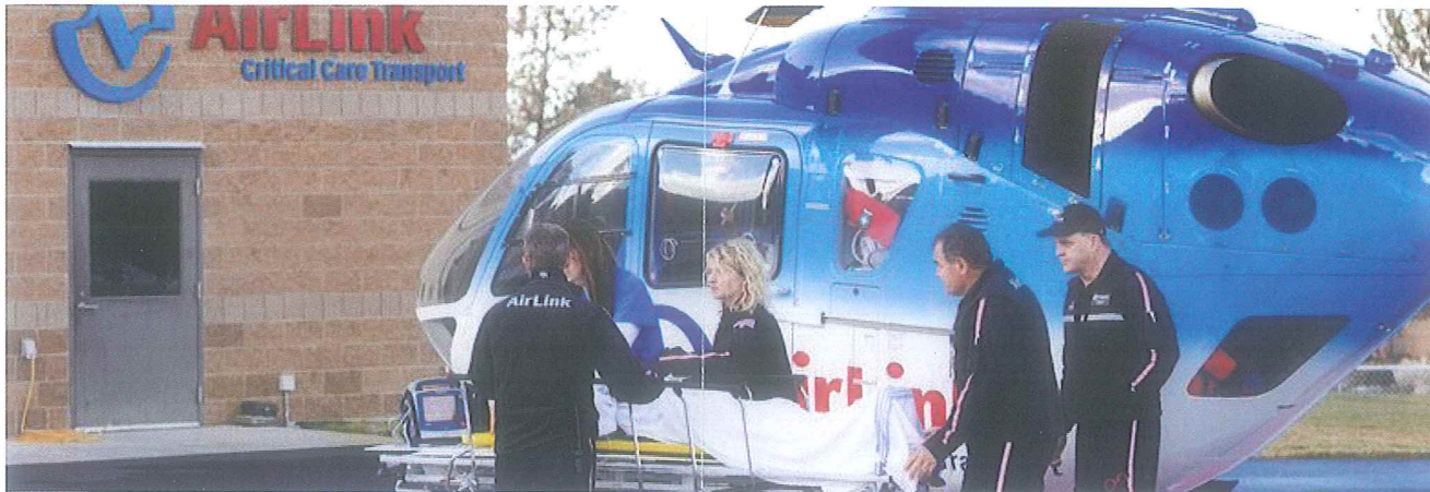
AIRLINK CRITICAL CARE TRANSPORT (CCT) AND AIRMEDCARE NETWORK (AMCN) EMERGENT AIR