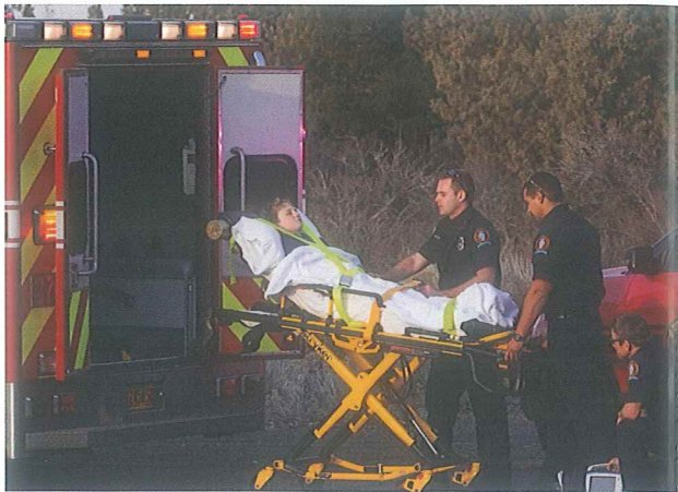
FIREMED GROUND TRANSPORTATION