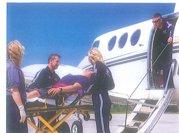
FLY-U-HOME NON-EMERGENT AIR