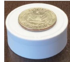
The white BLE Beacon is slightly larger than a U.S. quarter